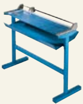
Optional features 00698 Stand