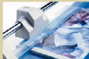
Automatic clamping on the cutting line