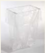
Optional features 20707 Waste bags